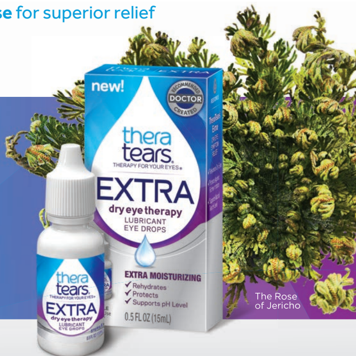
The Rose of Jericho

Learn about our complete line of dry eye therapy products at theratears.com