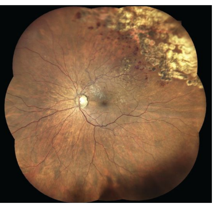
iCare EIDON's ultra-widefield optics from 120° to 200° field of view allows imaging of the central retina as well as the periphery.

surpassed the original capture lens. Even if you are only able to get one picture of a patient, you can still acquire the most critical areas for diagnostic comparisons. This can be pivotal for catching diabetic retinopathies, BRVO, CRVO, etc., in the far periphery.